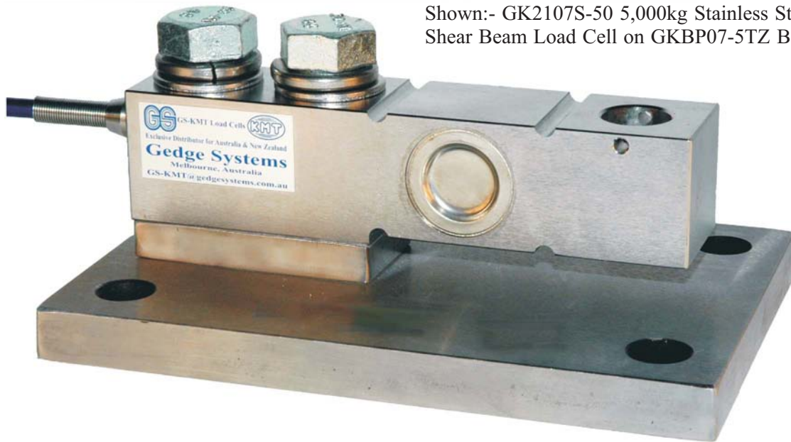
Shown:- GK2107S-50 5,000kg Stainless Steel IP68 Shear Beam Load Cell on GKBP07-5TZ Base Plate.